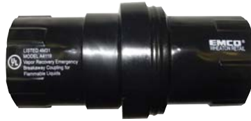
A4119EVR Coaxial SafeBreak