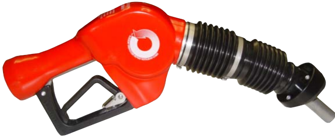
A4005EVR Balance Vapor Recovery Nozzle