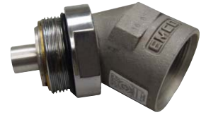
A4110EVR Coaxial Hose Swivel

S imple A ffordable F lexible E fficient