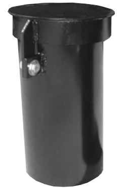
A0728-006 6" Steel