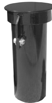
A0728-004 4" Steel